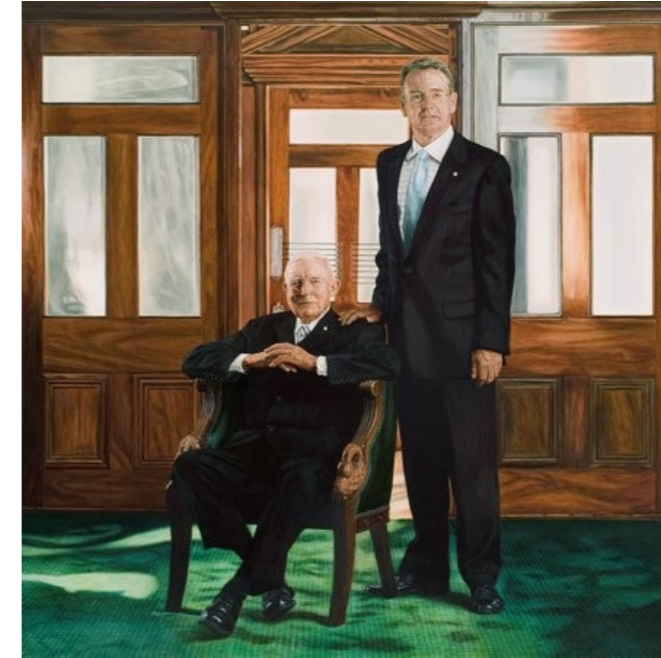
Sir Charles Court and Richard Court, 2006-2007